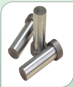
HSS DIE PUNCHES