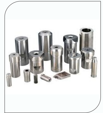
DIE SET HEADER