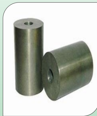
CARBIDE DIE GT55

B-31, Lucky Complex, Jeevan Nagar Chownk, Focal Point, Ludhiana - 141010