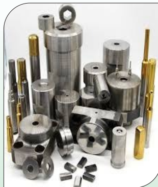
DIE & PUNCHES