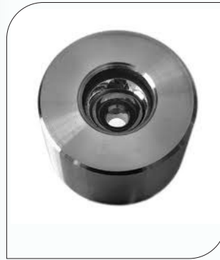
WIRE DRAW DIE